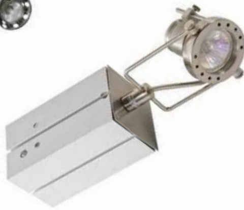
E02 50 Watt Spot on Arm Maxima