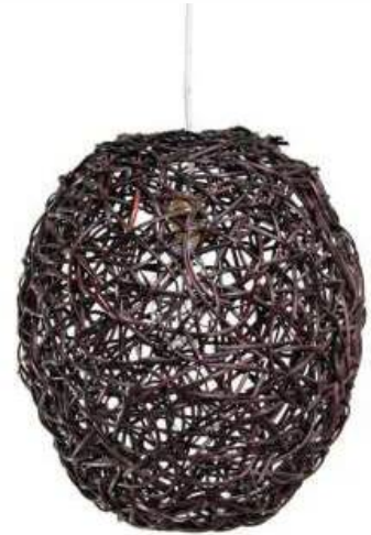
E54 Bird Nest Pendant Light