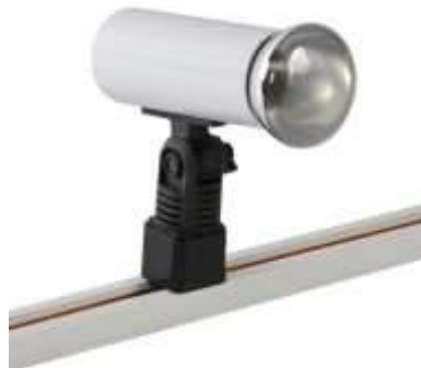
E08 100 Watt Spot Open