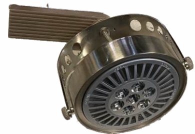
E51 12 Watt German Track