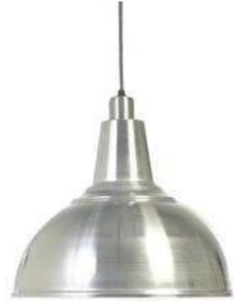
E32 Pendant Light