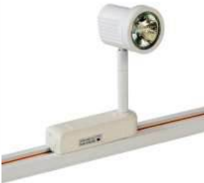
E07 50 Watt Track Spot