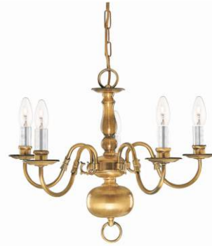
E46 Bronze Chandelier