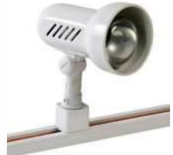
E09 100 Watt Track Spot Turbo