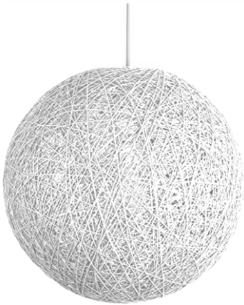
E61 White Pendant Ball Light