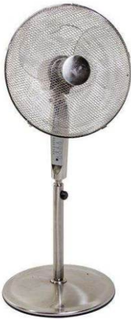
E36 Standing Fan