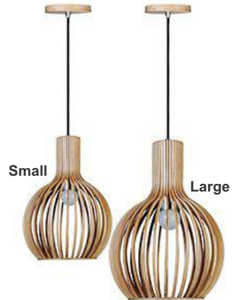
E27 Lattice Wood Pendants