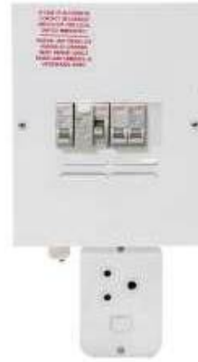
E41 Single Phase DB