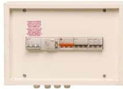
E43 60 Amp Three Phase DB