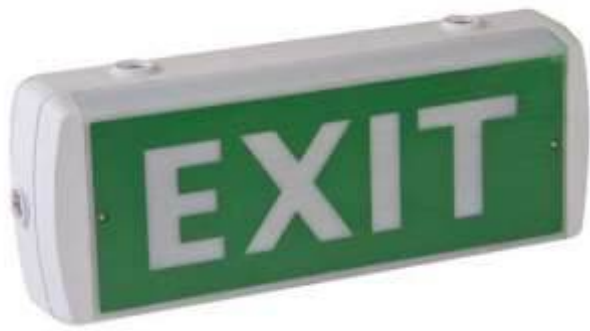
E35 Exit Light