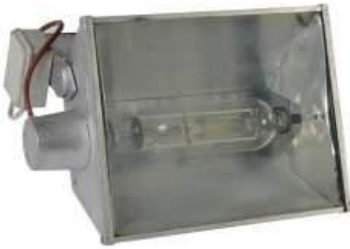
E17 2000 Watt Flood Light