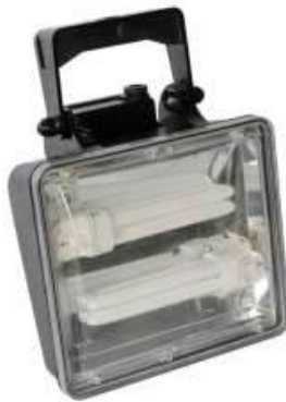
E18 72 Watt Energy Saver Flood Light