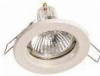
E11 50 Watt Downlighter