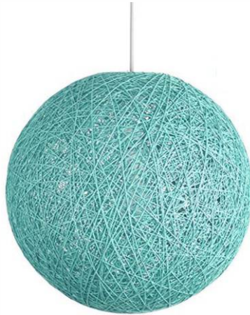
E62 Turquoise Pendant Ball Light