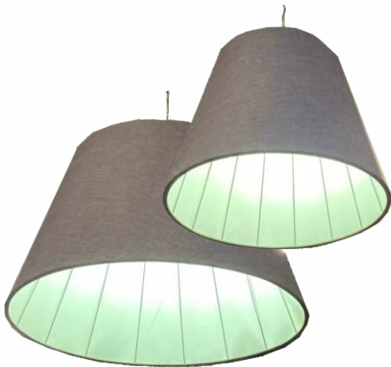
E31 Cone Pendant Light