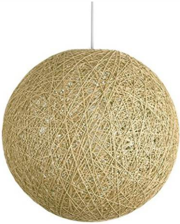
E60 Large Tan Ball Light