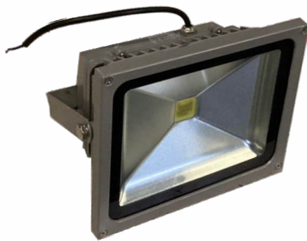
E 25 30-Watt LED Flood Light