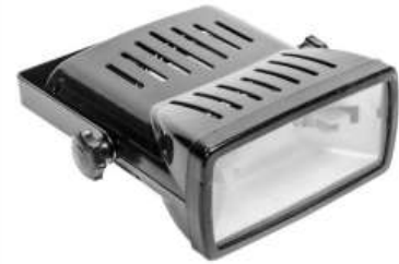
E20 150 Watt Metal Halide Flood Light