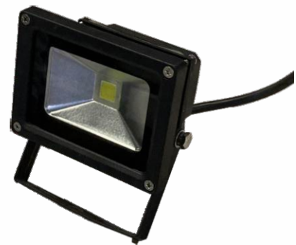
E26 70-Watt LED Flood Light