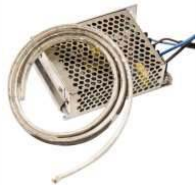
E57 LED Strip Lights - RGB