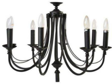
E33 Wrought Iron Chandelier