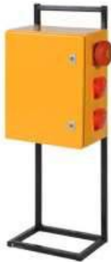
E44 125 Amp Three Phase DB