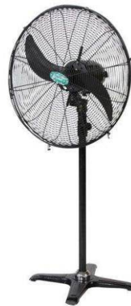
E37 Industrial Fan