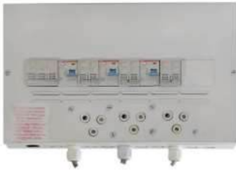
E42 30 Amp Three Phase DB