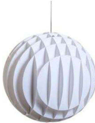
E55 Golfball Pendant Light