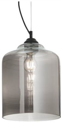
E58 Smoked Glass Pendant