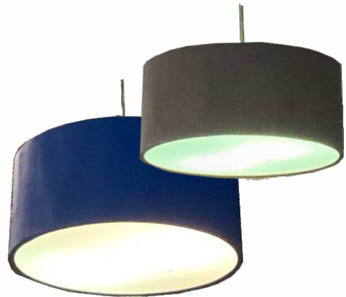
E30 NGC Lamp Shade Pendant Light