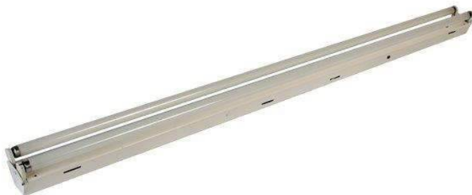
E21 Double Tube Fluorescent 600mm