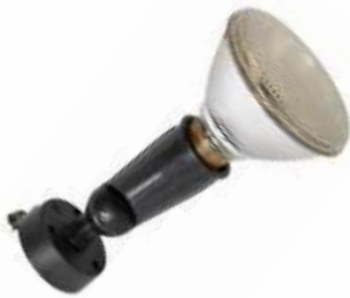
E10 150 Watt Spot