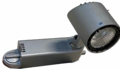
E06 12 Watt LED Track Spot - Silver