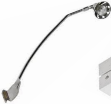
E01 50 Watt Spot on Arm