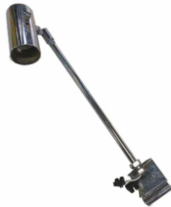
E04 Chinese Long Arm Spot