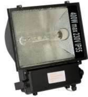
E16 400 Watt Flood Light