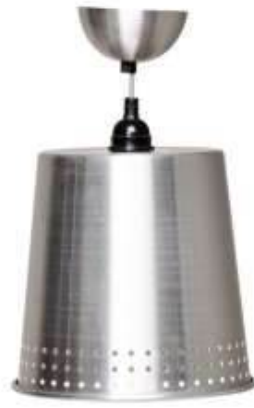
E56 Perforated Pendant Light