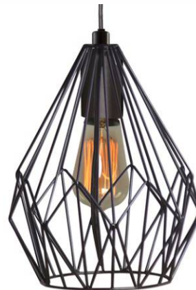
E29 Black Wire Pendant