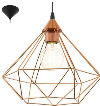
E28 Rose Gold Wire Pendant