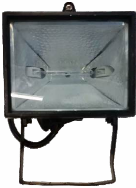
E14 500 Watt Flood Light