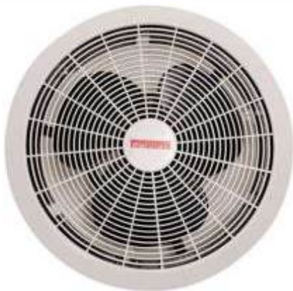
E38 Recessed Extractor Fan