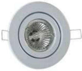
E12 50 Watt Tilt Downlighter