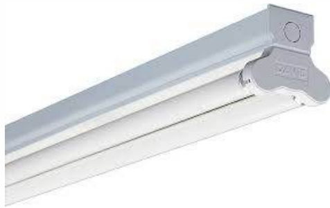
E47 1.2 LED FLUORESCENT DBLEUBE