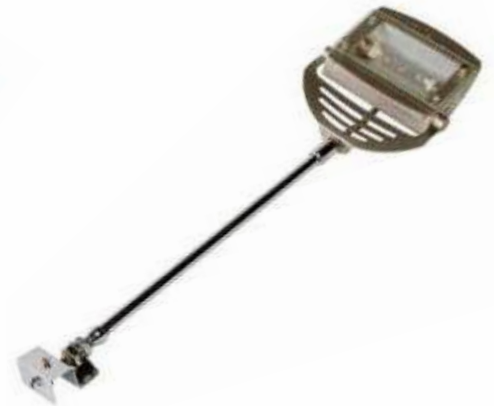
E03 150 Watt Flood Light on Arm