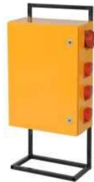
E48 250 Amp Three Phase DB