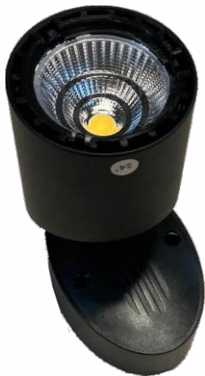
E05 7 Watt LED Track Spot - Black