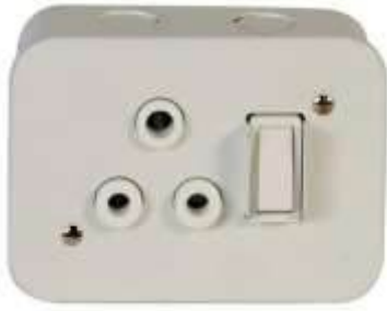
E13 15 Amp Plug Point