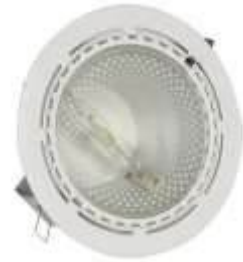
E59 150 Watt Round Metal Halide (Recessed)