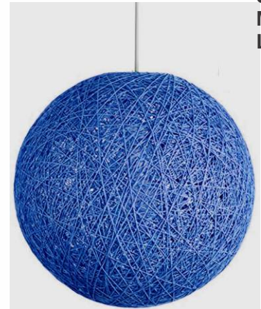
E63 Royal Blue Pendant Ball Light