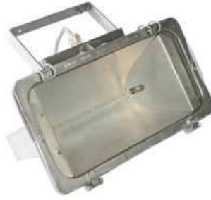
E15 1500 Watt Flood Light